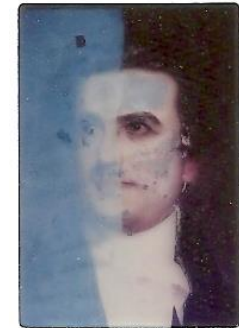
Ultraviolet light reveals old damage and repairs in a 19 th century American portrait

After treatment options are assessed, full written and photographic documentation will be prepared describing the painting, along with a treatment proposal that outlines what will be done to the painting and the cost of labor and materials.