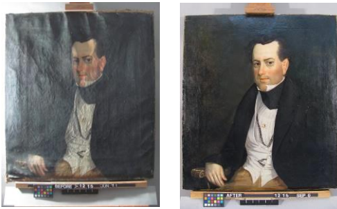
Before and after treatment of a 19 th century portrait

Hessling Conservation LLC provides services to help you preserve your part of our cultural heritage, whether it be a single family heirloom or an entire collection.