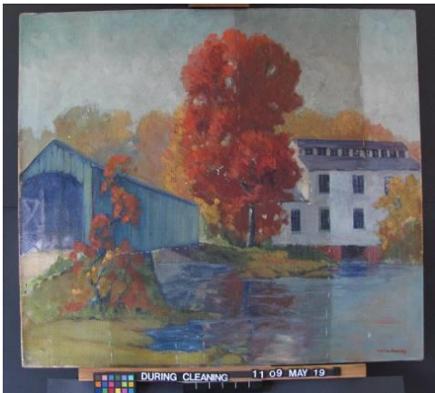
During cleaning of a landscape painting